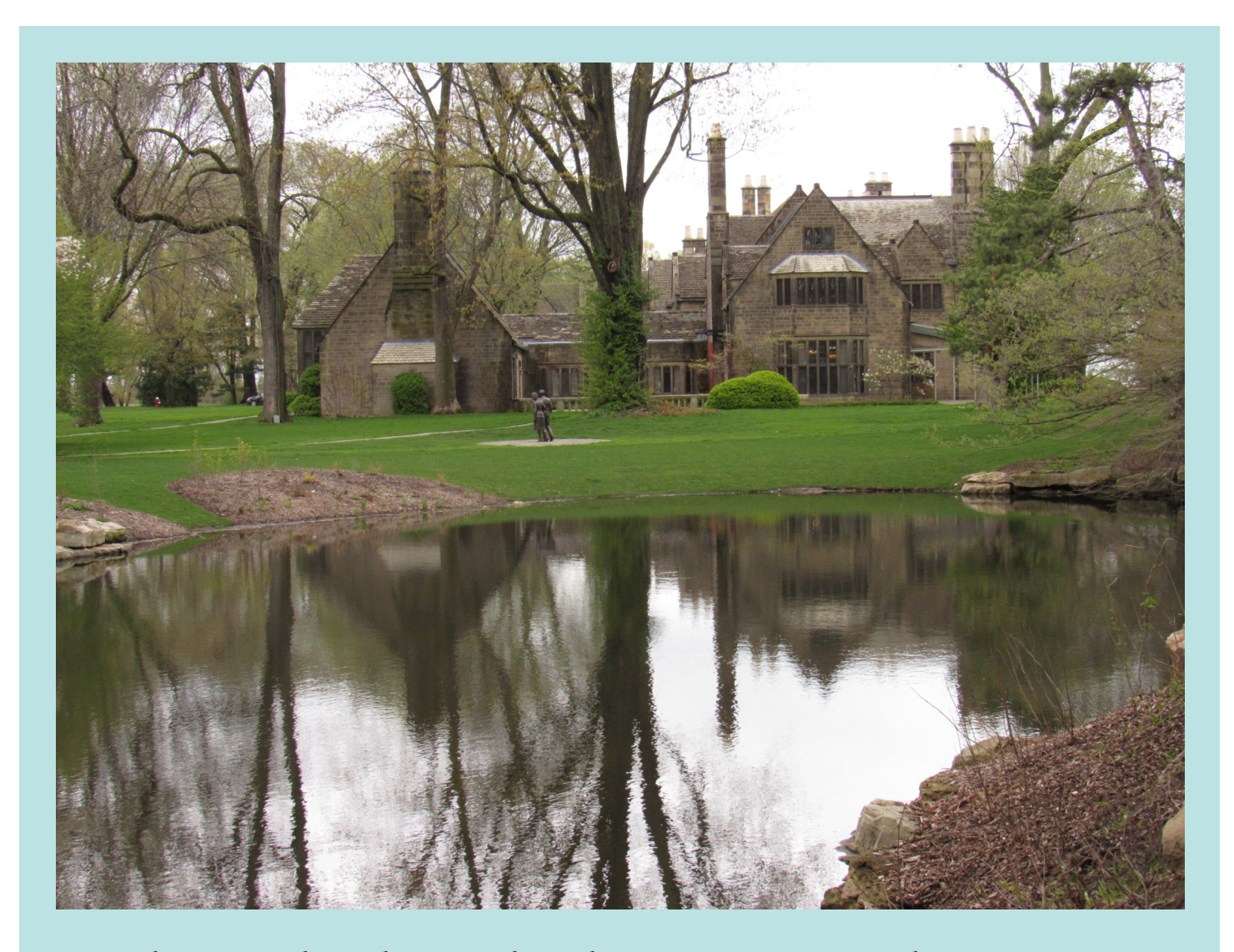
The Edsel and Eleanor Ford House