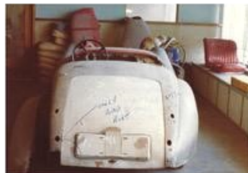
Garage in California where 670501 was found late 70's