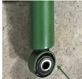
Note the out of round bushing

good thing to have two sets of hands for the job. It took us around 90 minutes to remove both strut assemblies from the car, then we took them down into my basement to try to push out the lower bushings, which looked pretty worn. We tried