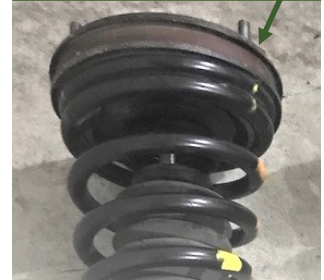
Upper shock mount urethane insulator

ous release of thousands of kilojoules of energy in my garage and the resulting flying heavy metal was not a picture we wanted to be a part of. So we quickly made the decision to have Dynamic handle the disassembly and assembly of the struts. We enjoyed a leisurely lunch at Rocky’s Coney Island just down the street while the new parts were put together. Lighter in the wallet, but with full stomachs and fully assembled struts, we headed back to my garage.