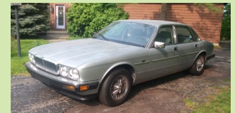
Car located in Grand Rapids

$8900 or best offer. Contact Alex at 269-599-1910