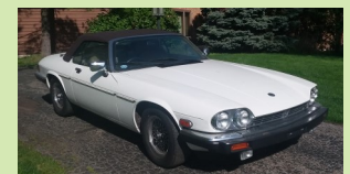
Car located in Grand Rapids

$14,900 or best offer. Contact Alex at 269-599-1910