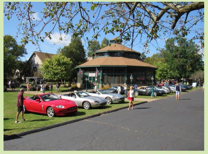
Jaguar Affiliates Group of Michigan

Details and opportunities to help out will be coming in the next few Indicators. Mark the date on your calendar and get ready for another great Concours!