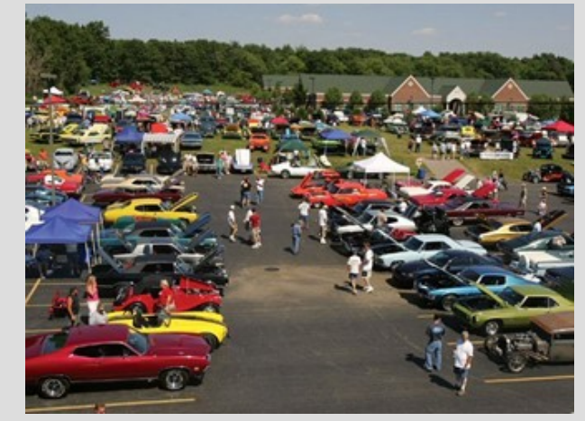
May 21<sup>th</sup> June 18<sup>th</sup>, July 16<sup>th</sup>, August 20<sup>th</sup>, and September 17<sup>th</sup>

Baker's of Milford Select Sundays from 2 - 7 PM