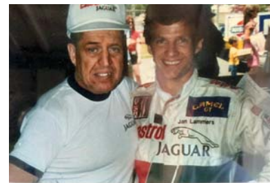
JAN LAMMERS (NL) WINNER: 1988 LEMANS, DAYTONA 24 HR, PALM BEACH, MID-OHIO/JAGUAR XJR-9 WORLD/IMSA CHAMPION SHIPS