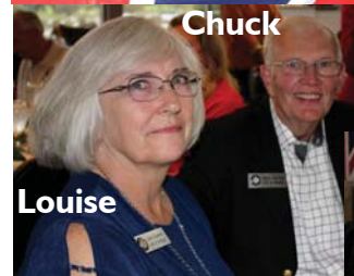
A team of DIAMONDS