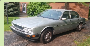
Car located in Grand Rapids

$8900 or best offer. Contact Alex at 269-599-1910