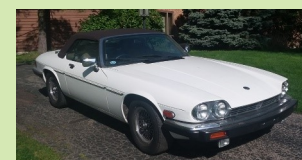
Car located in Grand Rapids

$14,900 or best offer. Contact Alex at 269-599-1910